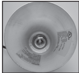
Tightly screw bulb into base.