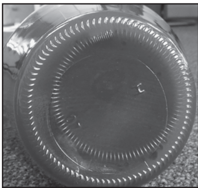
A metal coil rests on the bottom of the glass globe of your LAVA ® Lamp.